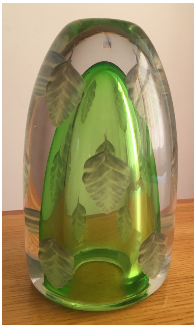
The Africa Food Prize Award